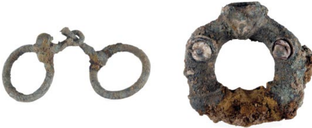
Figure 3-1. Horse bit and rein ring from Wetwang chariot burial site (courtesy of British Museum).

The horse bits were made of iron and bronze. The central part was formed of cast bronze, and bronze sheet had been hammered over iron rings on either side of the central part. The bits were delicately made; even the part in the horses' mouths was decorated. It is noticeable that distortion of the bronze sheet on the rings had not occurred, even though water is likely to have penetrated into the crevice between the iron and the bronze, and caused corrosion of the iron.