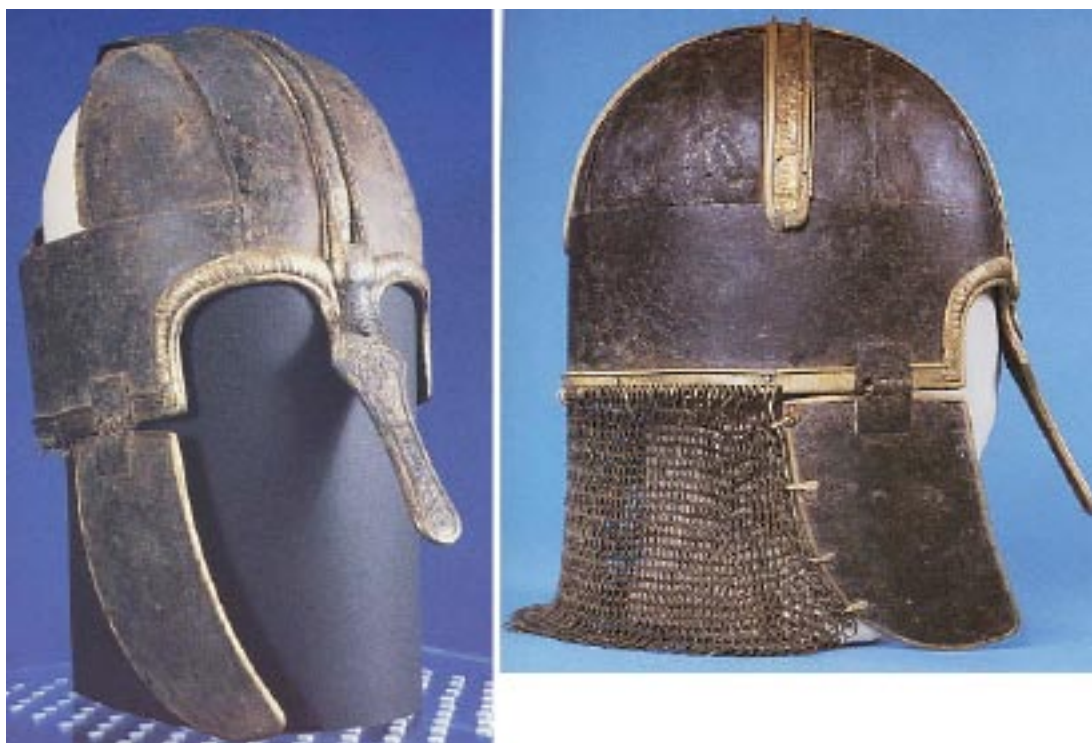
Figure 3-3. The Coppergate Helmet after conservation, (a) after conservation, and (b) after conservation and reconstruction.

The whole site had been waterlogged since deposition so there was little oxygen available. Pieces of timber were preserved at the same site as the helmet, indicating that the site was permanently waterlogged and that microbial activity was low. The helmet was found in clay soil that formed a grey crust over the helmet and preserved it to some degree. The interior of the helmet had been filled with a thick clay. The local environment had the effect of greatly reducing the amount of oxygen available, leading to remarkable preservation of the helmet. If oxygen had not been excluded, the thin iron plates of the helmet would have been completely corroded away; at a typical aerobic corrosion rate of 10 \mu\text{m}/\text{yr} the iron plate would have disintegrated