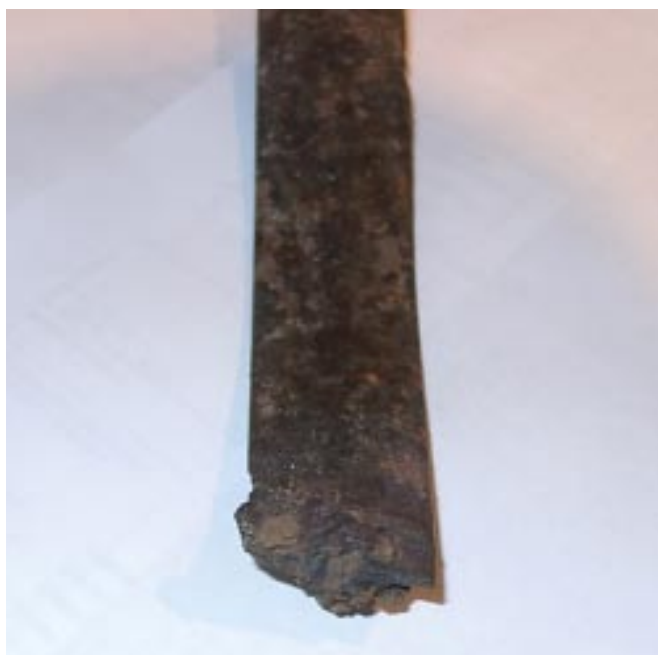
Figure 3-5. A broken part of the sword beater.

This object (Figure 3-5), used in weaving, measures approximately \frac{3}{4} metre long with a wooden handle. It was found in the same pit as the helmet and therefore it was assumed that it was exposed to the same environment for the same amount of time. The sword beater had broken in two places, so that the iron core was visible and the exfoliating replacement corrosion of the iron was clear.