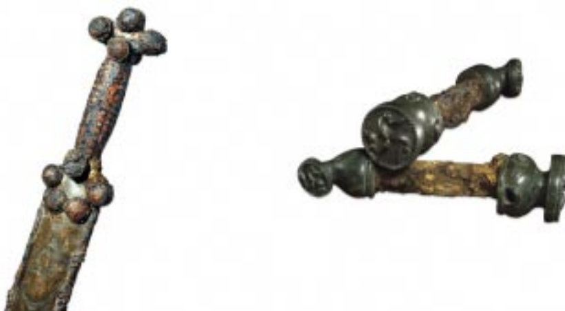
Figure 3-2. Handle of sword and Linchpins from Kirkburn chariot burial site.

The decorated linchpins supported the wheels of a cart or chariot on their axles. The main parts are made of iron, while both ends were decorated with a bronze cap, cast onto the iron bar. There are no indications of expansive damage to the bronze caps at the end of the iron rods.