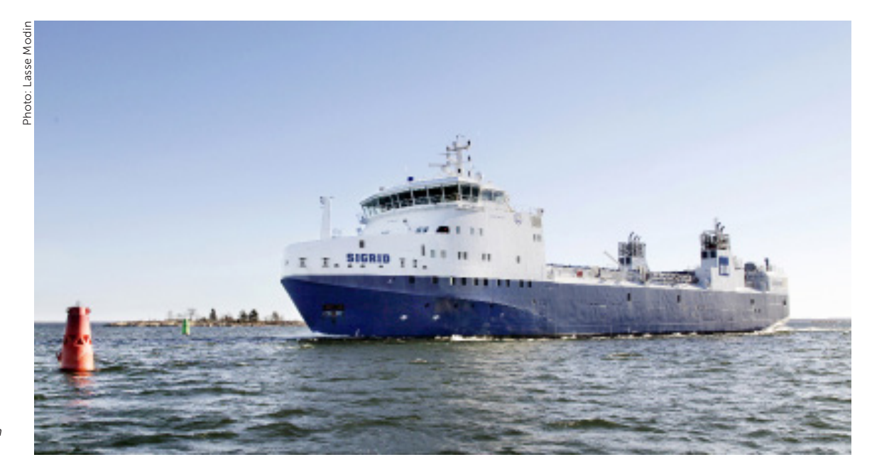
Decommissioning waste will mainly be transported to the SFR at Forsmark by SKB's own vessel, M/S Sigrid.

cases it will also be possible to remove the radioactivity in different ways so that material can be exempted. It can then be recycled instead.