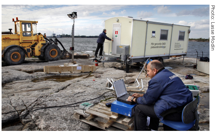
Preparatory surveys for the extension of the SFR were conducted in 2008–2010. The results have led to the selection of a location for the extension.