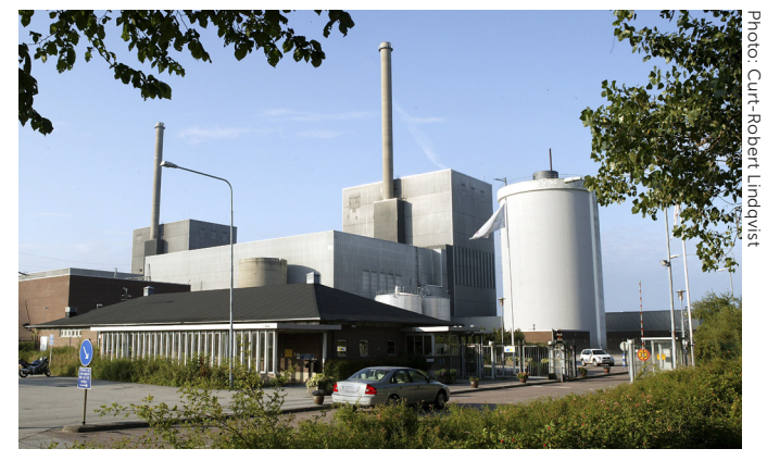
The reactors at Barsebäck have been shut down and are already waiting to be dismantled.

Constructing the extension itself is expected to take about five years and will employ about 200 people. It is planned to remove about 1,140,000 cubic metres of rock during the construction work.